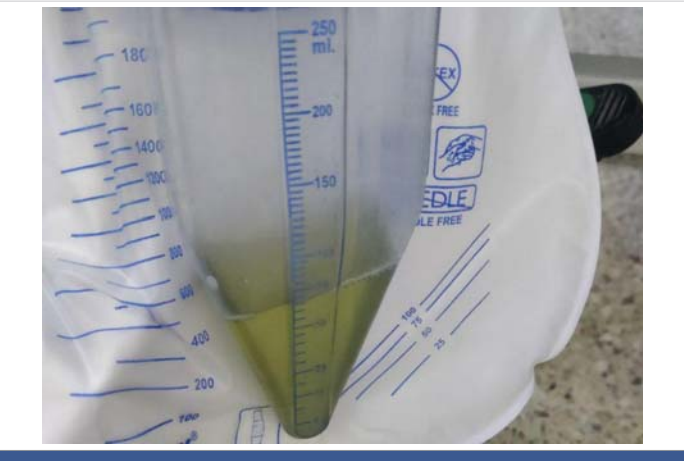
Figure 1: Urometer filled with green coloured urine.

Urine analysis results included green color, pus cells 1/High Power Field, and epithelial cells 3/High Power Field. His liver function test values were: serum bilirubin (direct) 0.2 mg/dL, total protein 6.2 gm/dL, aspartate aminotransferase 37 U/L, alanine aminotransferase 40 U/L, alkaline phosphatase 102 U/L, and total bilirubin 0.6 mg/dL. The picture in Figure 2 illustrates the green color of the nasogastric free drain bag collection, which was not previously the case. The renal function test was within normal limits. After 48 hours, there was no growth report from the urine culture sensitivity test. Following the event, the infusion of dexmedetomidine (0.3 mcg/kg/hr) was substituted for propofol. Normal vellowish-colored urine was collected in the uro bag 5 hours after the propofol infusion was stopped. On the fifth day of mechanical ventilation, the patient received a secondary diagnosis of ventilator-associated pneumonia, with a positive culture of Acinetobacter in the tracheal aspirate. The culture sensitivity report was followed when administering the injection of colistin. Better P/F ratios of more than 250 indicated that the oxygenation status was improving. The patient was not on any inotropes, and signs of sepsis were not present. The patient was extubated on the 12th day and shifted out of the ICU the next day.