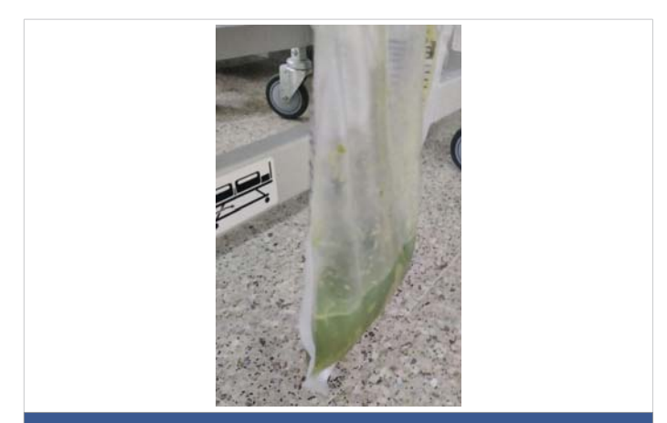
Figure 2: Nasogastric tube free drain bag partially mixed with leftover food particles and green coloured.

An intriguing and uncommon event sometimes observed in the context of anesthesia and critical care is green urine. Although Blakey, et al. estimated the phenomenon's occurrence to be less than 1%, the precise incidence remains uncertain [9]. Substances consumed are the main cause of green urine in most situations. Green urine may result from medications such as amitriptyline, cetirizine, flutamide, indomethacin, methocarbamol, methylene blue, mitoxantrone, propofol, phenylbutazone, and triamterene. Potential dyes include carbolic acid, derivatives of flavone, indigo blue, indigo carmine, and methylene blue. It can also be caused by pathological conditions such as indicanemia, biliverdin, Pseudomonas infection, and Hartnup disease [7,10-12]. The presence of phenolic metabolites is responsible